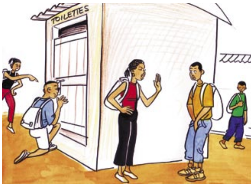
Privacy is equally important to boys and girls