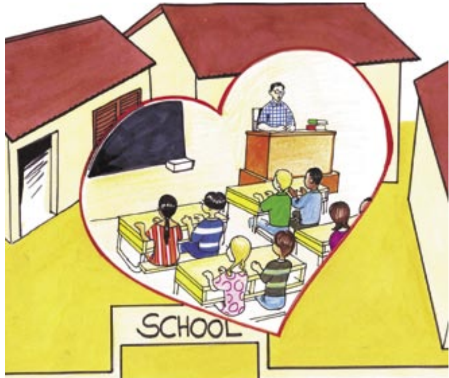
The classroom is often the most important social unit after the family