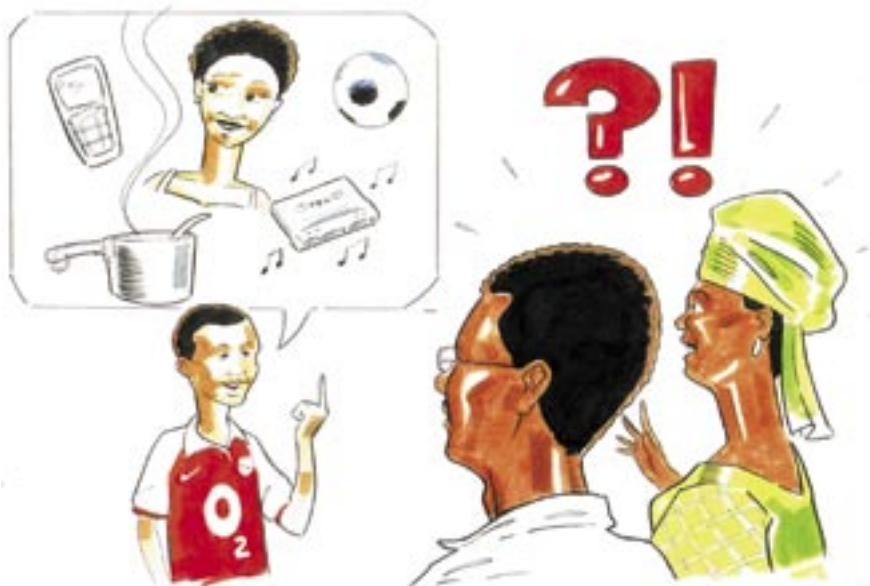
Adults need to understand that children may value material things, such as gadgets, because it helps them to fit in with their peer group.