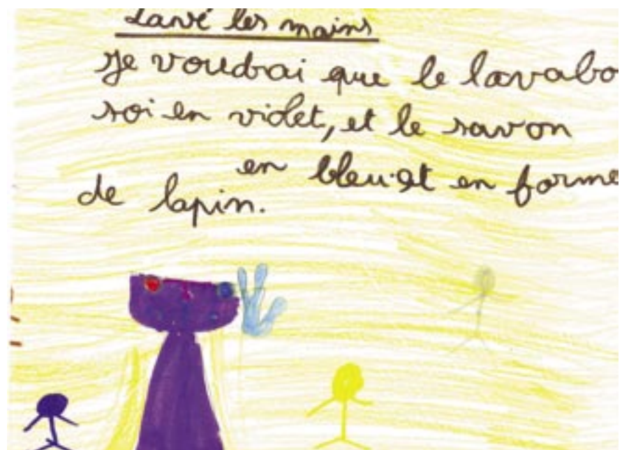
Example of drawing by primary school pupil suggesting taps in violet and blue soaps

This research project came up with some fairly straightforward recommendations to many of the issues that were identified. However the