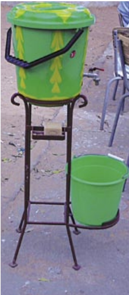
An example of the different color hand-wash stands developed for the behavior trial.

at the right height for the children and had a prominent soap holder. Each grade received a different color hand-washing stand and it was emphasized to the class that this was their possession. During the course of the week, two brands of soap were used. “Marabou” a non-perfumed, 250-gram cake of white soap was used for a three-day period and a green 125-gram cake of “Lux” beauty soap with a strong fragrance for another three-day period.