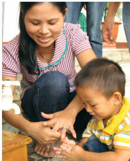
Illustration 1: Mother Washing Hands with Her Child

This Learning Note documents the development process of the caretakers' program with a focus on how it was designed, implemented, and monitored. Lessons learned and challenges are also highlighted to assist program managers in designing and managing evidence-based handwashing with soap and/or other hygiene promotion programs. A separate publication will focus on the process of developing the children's handwashing program.