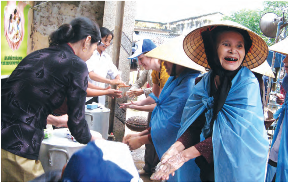
Illustration 6: A Grandmother Washing Hands at a Market Meeting

In addition, very few children in the survey had experienced an episode of diarrhea in the two weeks before the survey. Based on this, before the scale up of the program in the remaining 240 communes, significant emphasis was placed on communicating to mothers that handwashing with soap is an easy way to ensure the health and development of children, rather than focusing on diarrhea, and on helping mothers to ensure that soap and water were readily available in places for handwashing.