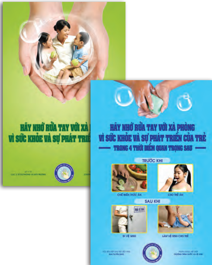
Figure 2. Main poster (left) and four critical junctures poster (right)

Posters promote a call to action. The tagline urges mothers to “Handwash with Soap for the Health and Development of Your Children.”