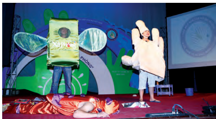
Illustration 2: Scene from a Skit on Why It Is Important to Use Soap to Clean Dirty Hands

Second, only a single set of materials had been developed, which was used by both the master trainers in their Training of Trainers sessions as well as by the trainees when they worked with the ultimate beneficiaries. As a result, the trainers did not have adequately tailored materials to engage mothers. A handwashing motivators manual was needed.