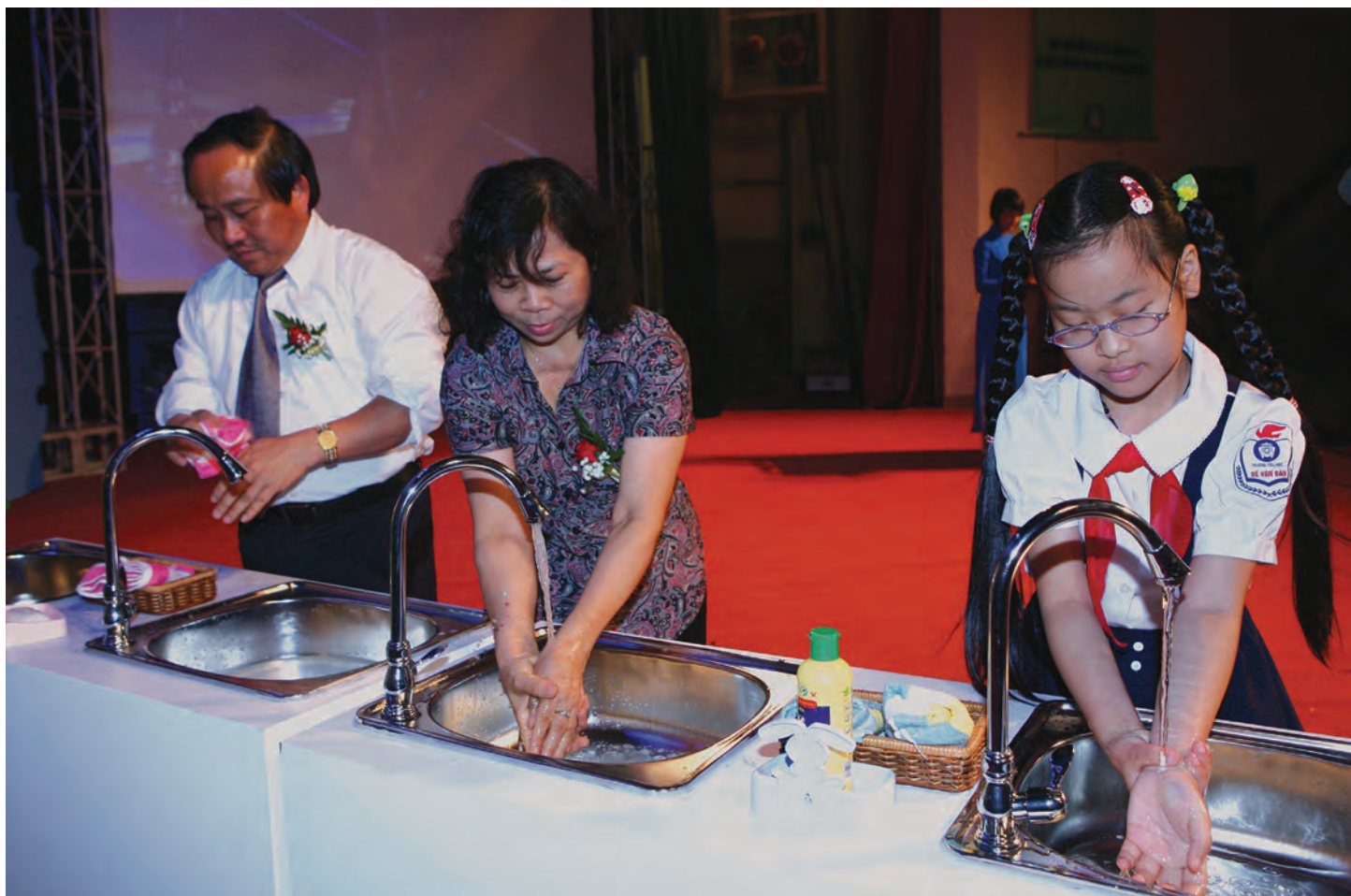
Illustration 3: Ministry of Health, a Vietnam Women's Union Representative and a Schoolchild Wash Hands with Soap During Launch Ceremony of the Vietnam Handwashing Initiative

Field supervision. Alongside the Vietnam Women's Union, who is responsible for supervising field-based activities, WSP actively supported supervisory missions, particularly during key project components such as training and implementation of activities. As a result of the field supervision, the content of the Interpersonal communications component evolved as described above.