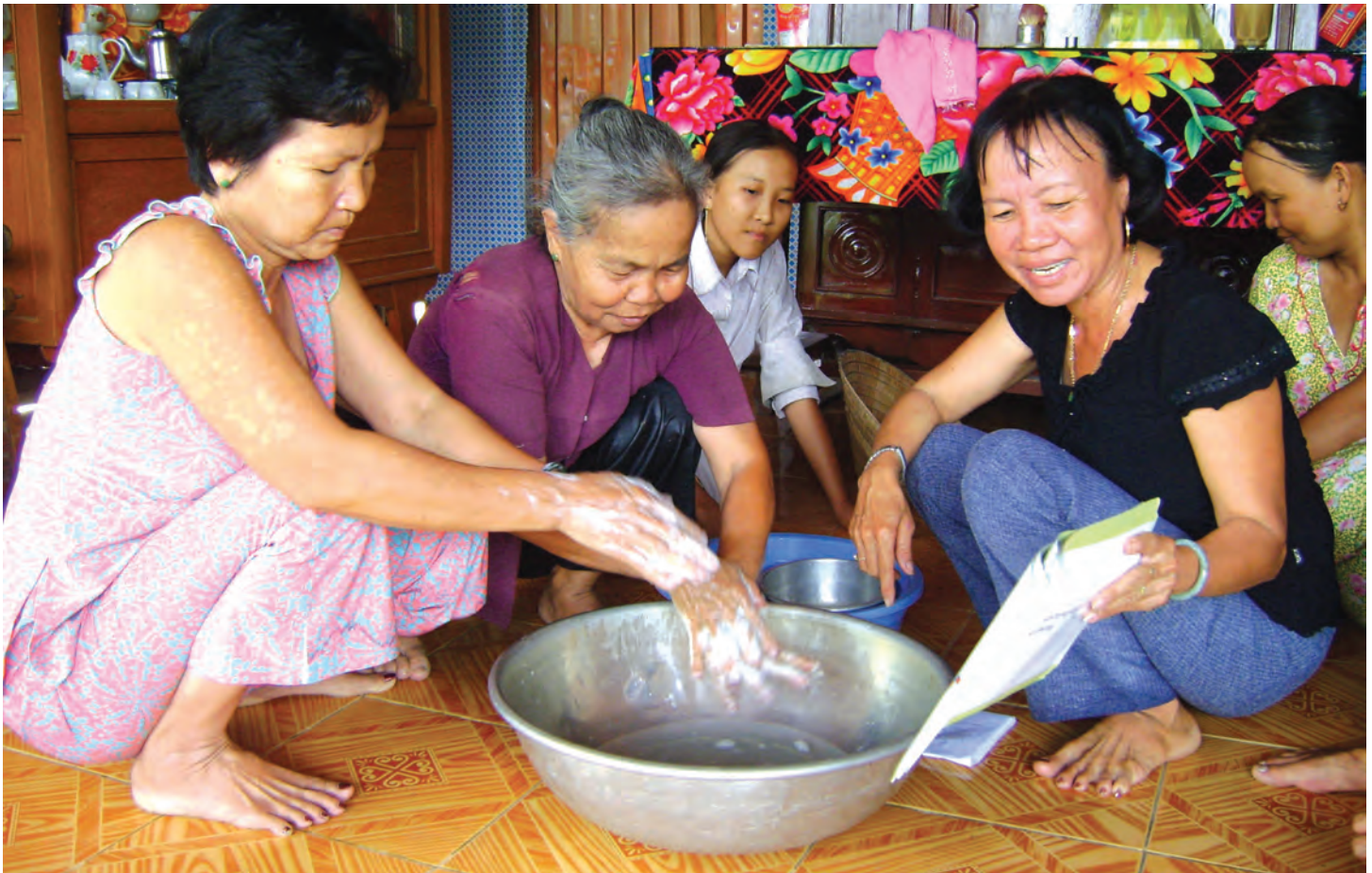
Vietnam Women's Union members use cue cards and demonstrate handwashing at a group meeting.