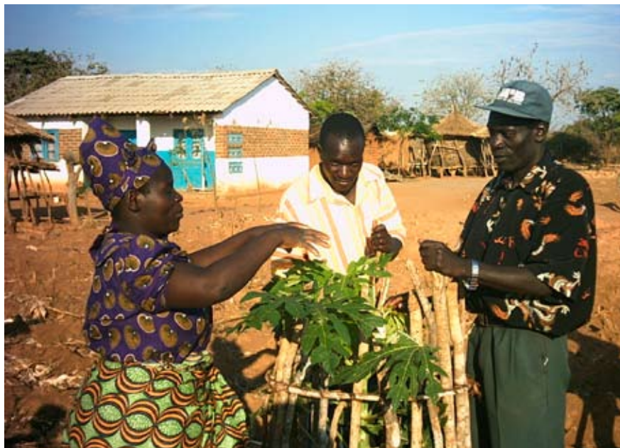
Inspecting a papaw tree growing on an Arborloo pit, Embangweni

This field note summarizes the lessons learned thus far in Malawi's efforts to popularize ecological sanitation.