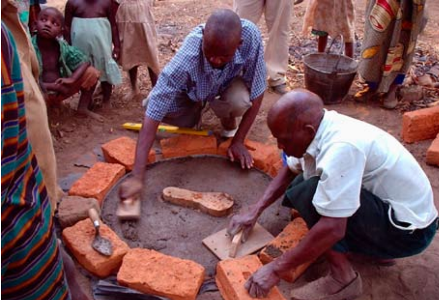
Making concrete slab for Ecosan-toilets, Malawi

works, which means there are good opportunities for promoting ecological sanitation. Embangweni lies in an area where soil fertility has been steadily declining for a number of years and population pressure means that new fertile land is unavailable. The land is such that maize will not yield any cobs unless artificial fertilizer is applied, but the price of commercial fertilizer has increased to unaffordable levels after the removal of subsidies. Subsistence