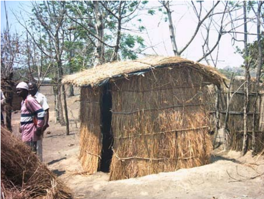
Simple Fossa alterna. Salima project