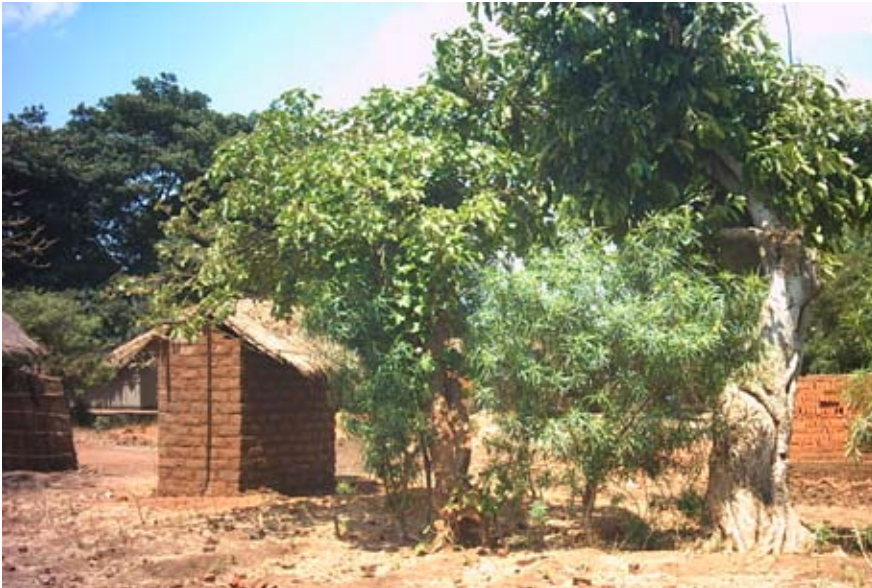
Traditional latrine, Lilongwe suburb