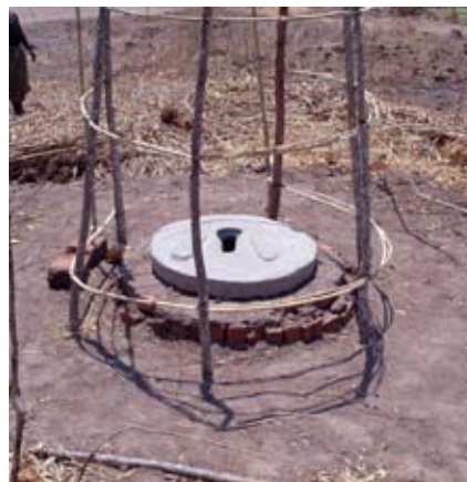
Basic Arborloo unit, Phalombe plain, Malawi

It should be emphasized that this EcoSan initiative in Malawi was primarily about testing the cultural sustainability of simple EcoSan options. To this effect, more focus was placed on getting slabs made, distributed and used than on creating a viable 'self-standing' supply stream. A number of different approaches have been used (see for example Box 3) that rely