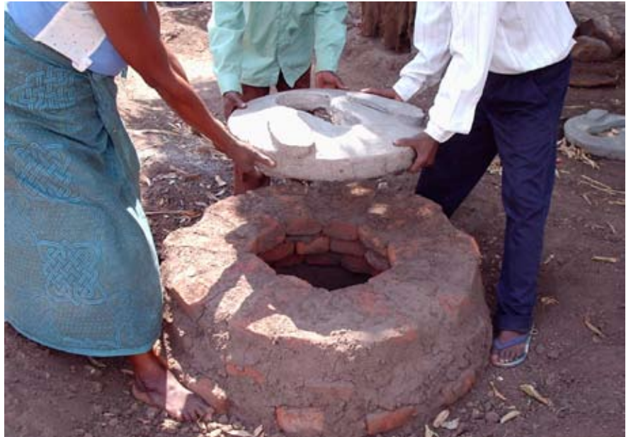
Installing small slab on bring ring beam for Arborloo

The Embangweni project got off to a slow start, as the task of promoting and developing the EcoSan concept was given to WaterAid’s already