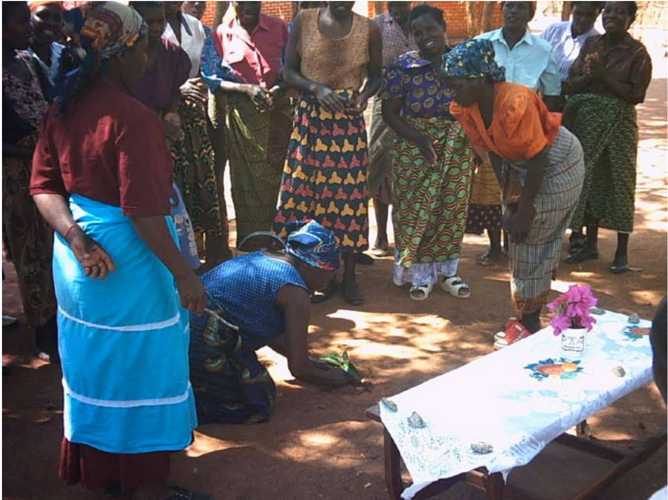
Community theatre used to promote Ecosan-toilets and tree planting, Embangweni

become convinced by the evidence provided by accelerated rates of fruit tree growth and want to use the fertilizer on their main crops. When this occurs they place a higher value on both the permanence and the appearance of the superstructure and become interested in 'upgrading' to the Fossa alterna (D'Souza).