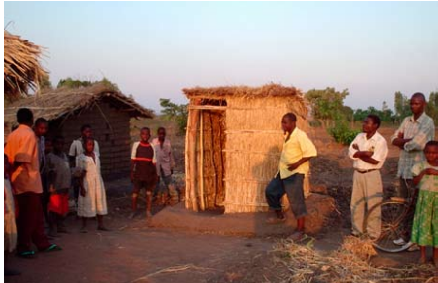
Arborloo on Phalombe plain, Malawi

EcoSan has had an interesting effect on the gender roles associated with latrine construction. During the baseline survey the men and women were asked separately why they did not have a latrine. The men tended to give technical reasons such as a lack of wood or tools, or sandy soils causing pits to collapse. The women were more direct and thought it was more to do with the laziness or unwillingness of