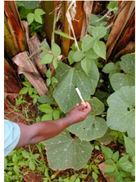
Pumpkin growing on Arborloo pit

I use manure, my yield is 150kg. And it is very good tobacco with more weight for fewer leaves.”